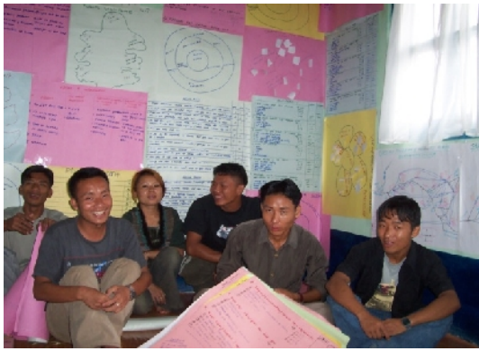
TI Staff on HRG mapping and site assessment.

(Map geographical and social overview of a site and help HRGs analyse the range of risk and vulnerability factors they experience that increase their susceptibility to HIV/STI transmission).