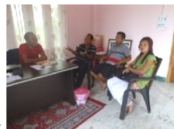
Chairman YMS with Director and Program Managers

The services provided by the TIs and linkages to other services are outreach & counseling, Needle Syringe exchange program, condom promotion, basic/STI services & abscess management, IEC, advocacy, referral to OST, DOT, ICTC, ART, Detox & Rehab centres, PLHA networks for home based care & support etc.