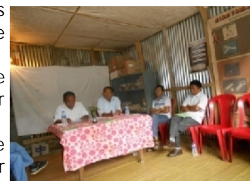
YMS Annual Board Meeting

Yingli Mission Society work on a people-centric model of development in areas of public health, education, women empowerment, community development and social welfare with dream, hope and vision for the future. The future where our needy friends are respected and cared for, the future where equal opportunity is given to all and a society with fullness for living our life.