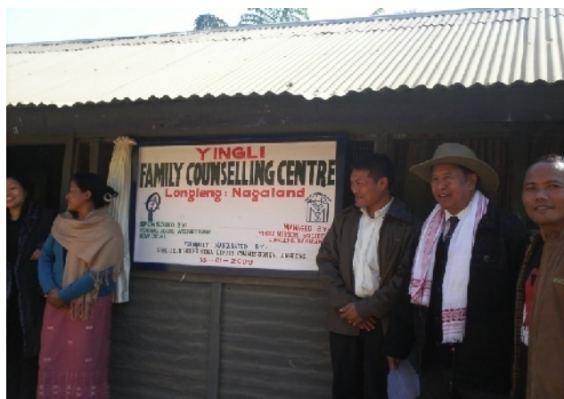
(Deputy Commissioner Longleng visiting YMS Family Counseling Centre)

YMS Family Counseling Centre, supported by Nagaland State Social Welfare Board, serves the maladjusted, disrupted and problem-ridden families from the surrounding rural areas. It focuses on assistance to women and children suffering from atrocities and stressful situations.