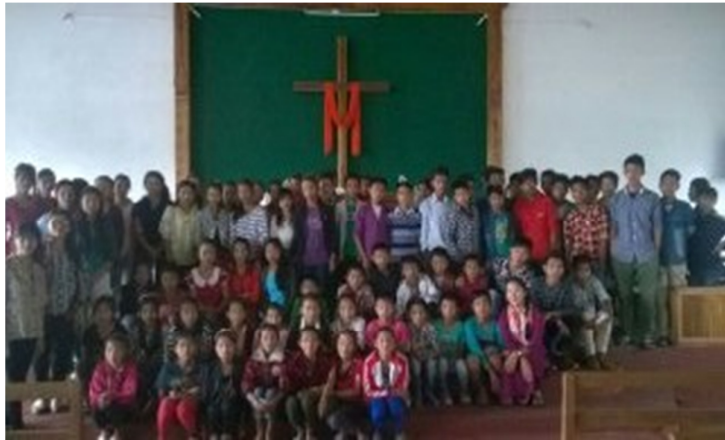
Awareness Program with Students on Hepatitis B&C at Longleng Town Baptist Church

It is learned that Hepatitis C has always been an area of concern for the people of Nagaland but in absence of any documentation or research data, not much could be done by the State government, NGOs and agencies working in the health sector. Though Hepatitis C is curable with treatment lasting from 6 months to 1 year, cases of HCV related deaths have been reported, and that people continue to die of a preventable and curable disease because of 'lack of awareness and high treatment cost'.