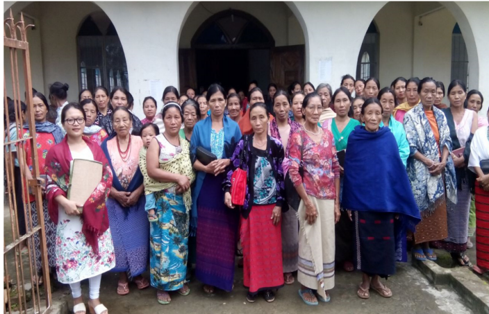
Awareness Program for Women on Hepatitis B&C at Kangching Baptist Church

The objective of the program is to increase awareness and diagnosis of HBV and HCV in rural area.. This program was implemented on May 2016 in Longleng District with support from NNP+ Kohima, Nagaland. Key activities include; awareness programmes, counseling, 1st level HCV screening (Card Test), mobile HCV screening in remote areas, referral & linkages, IEC and advocacy.