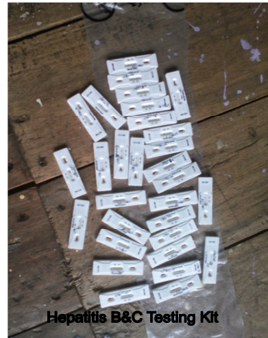
Hepatitis B&C Testing Kit

Received - 200 Tested - 110 Result - All -ve